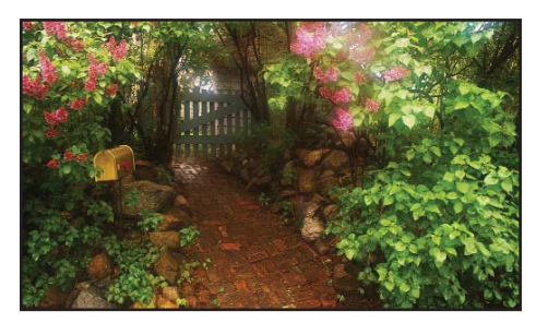
When the world says, "Give up." Hope whispers, "Try it one more time." -Author Unknown

My grief will last for the remainder of my life; it is just different, more manageable and more integrated into my life. Based on my own experiences, I would like to illustrate some differences I have discovered between the early and later stages of my journey, using specific essentials that I believe are common to the experience of all bereaved individuals.